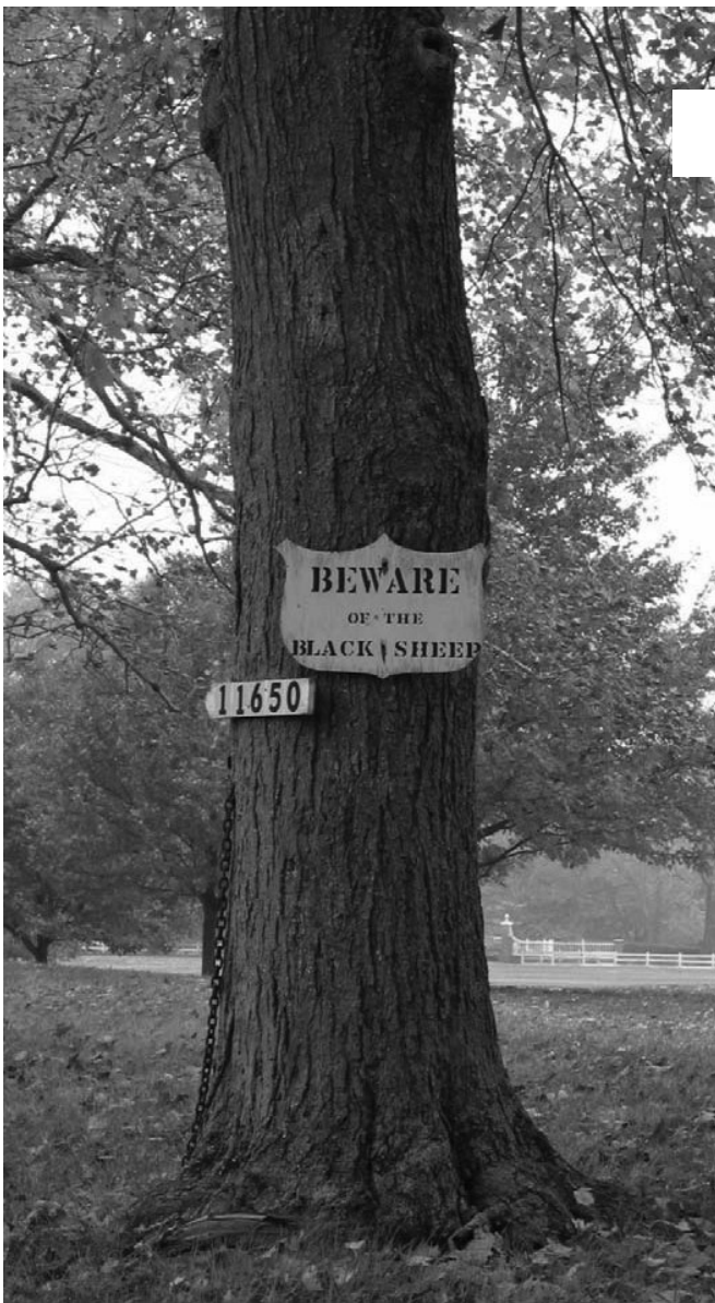
2004 sign at the entrance to Wye Heights Plantation

A Memorial Service and celebration of Tom's life will be held at Wye Heights and Wye Park in the Spring 2021.